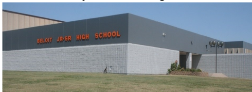
Beloit Special Education Cooperative